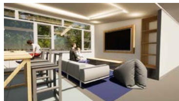
BREAKOUT PERSPECTIVE KT8