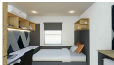
BEDROOM PERSPECTIVE KT8