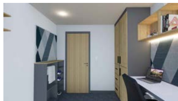
BEDROOM PERSPECTIVE KT8