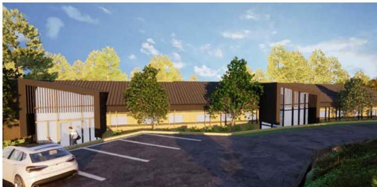
NEW BOARDING WING NORTH PERSPECTIVE KT8