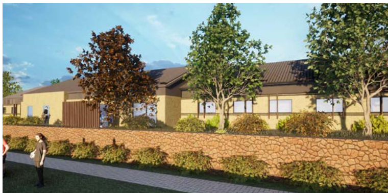
NEW BOARDING WING SOUTH PERSPECTIVE KT8