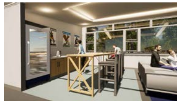
BREAKOUT PERSPECTIVE KT8